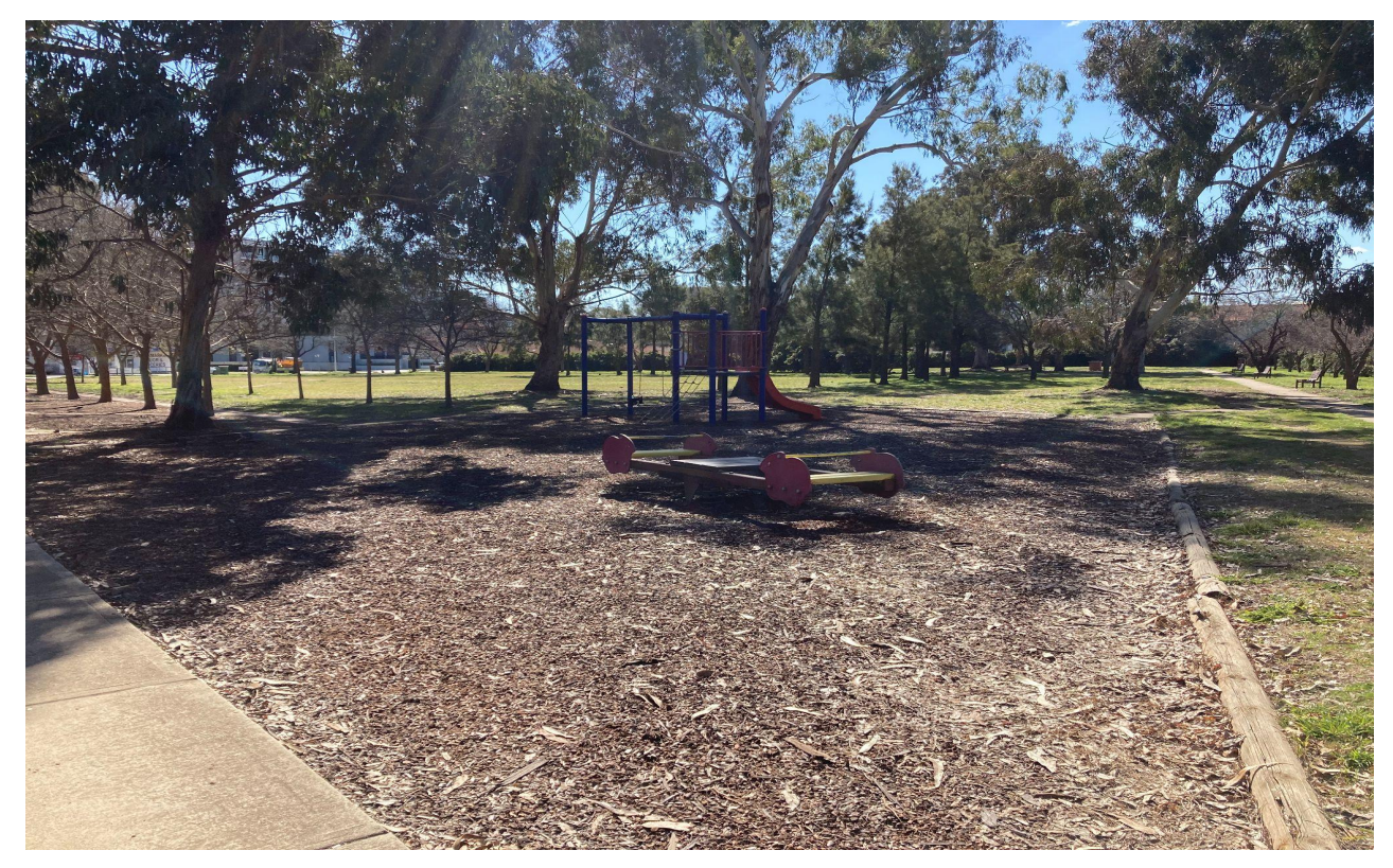
Playground in Lowanna Street Park, Braddon

During the ACT COVID lockdowns, local residents noticed that the Lowanna Street park was poorly appointed in terms of infrastructure for community use. In particular, the park includes only two pieces of play equipment. Usage of the park increased during the lockdown period which highlighted the paucity of facilities.