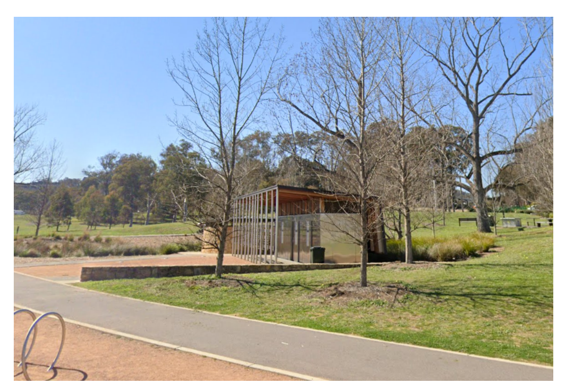
Kings Park, near the Carillion

The lack of public toilets in Braddon is an immediate and ongoing issue that the Braddon Collective has raised in a number of forums over the past 4 years. We submit that the ACT Government urgently considers an upgrade and expansion of the public toilets in Haig Park . We consider the lack of toilets in the park to be a major issue for Braddon and we propose a toilet block with multiple stalls, similar to the one near the Carillion in Kings Park, or facilities in parks in Belconnen.